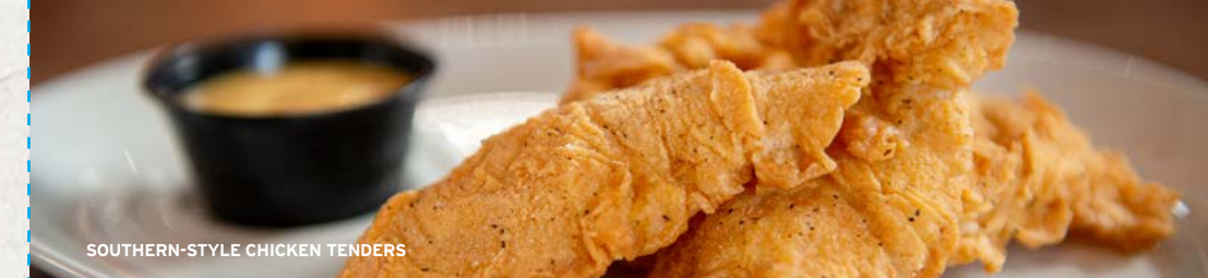
SOUTHERN-STYLE CHICKEN TENDERS

Delicious red skin potatoes topped off with cheese curds, bacon, and your choice of eggs and toast. Finish your poutine with gravy or hollandaise. $17.49