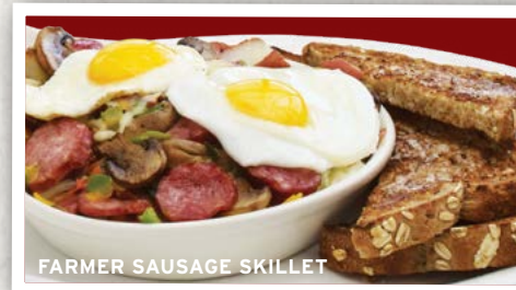
FARMER SAUSAGE SKILLET

Farmer's sausage, tomatoes, green onions, mixed peppers, mushrooms and tri-cheese blend. $18.99