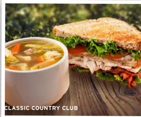
CLASSIC COUNTRY CLUB