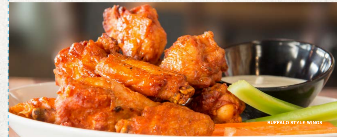
BUFFALO STYLE WINGS