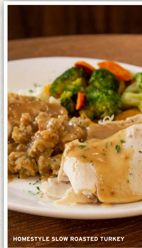
HOMESTYLE SLOW ROASTED TURKEY