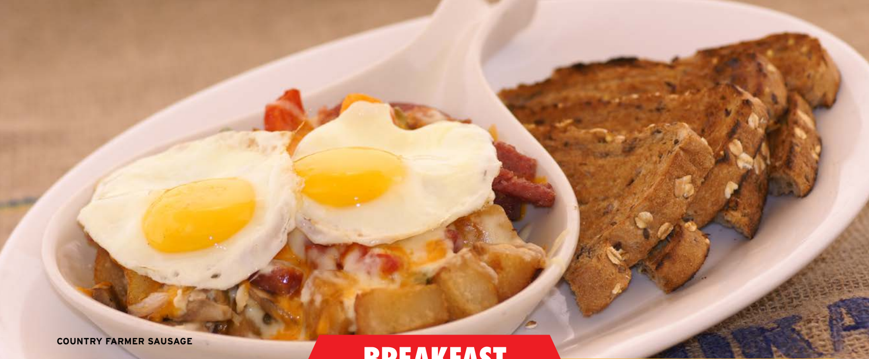
COUNTRY FARMER SAUSAGE