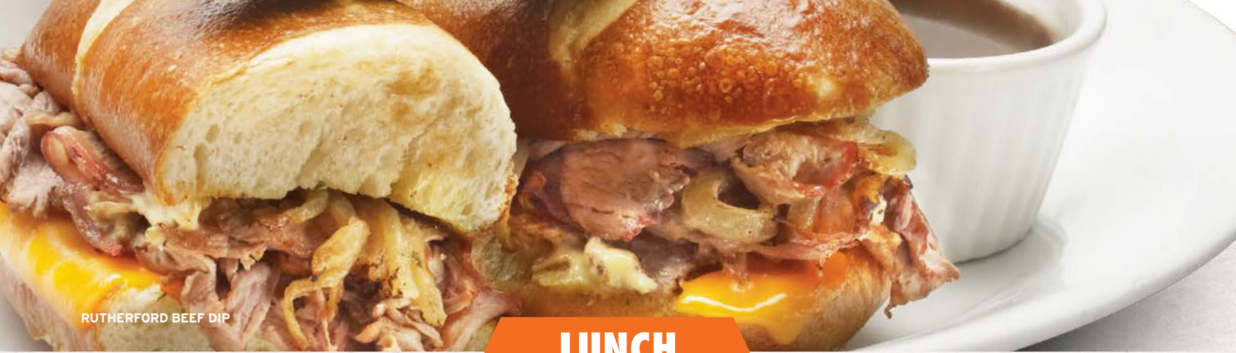
RUTHERFORD BEEF DIP