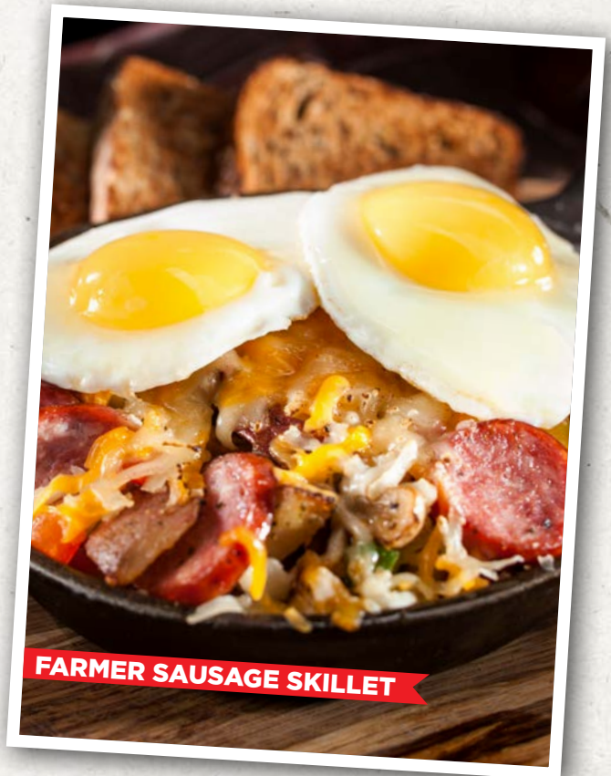
FARMER SAUSAGE SKILLET

TRADITIONAL BENNY SKILLET $18.99 2 poached eggs on top of Black Forest ham, covered in hollandaise sauce.