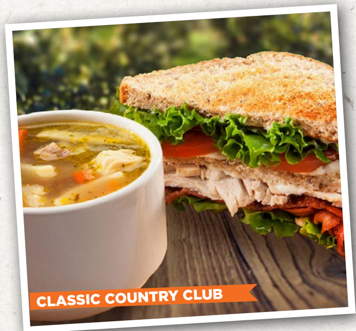
CLASSIC COUNTRY CLUB

Avocado, maple bacon, Canadian Cheddar, lettuce, mayo and beefsteak tomato. $17.49