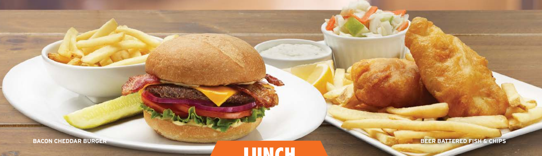
BACON CHEDDAR BURGER