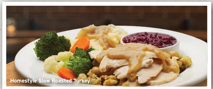
Homestyle Slow Roasted Turkey

abc's Smokehouse pulled pork with sautéed onions and Sweet Bourbon BBQ Sauce over top a skillet full of penne style Mac'N'Cheese, garnished with Parmesan cheese and green onions. Served with garlic focaccia and Caesar salad. $19.99 original mac'n'cheese $15.99