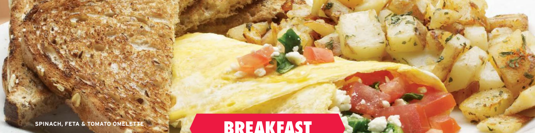
SPINACH, FETA & TOMATO OMELETTE