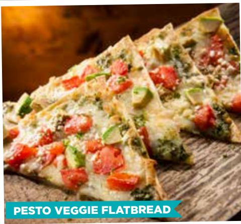
PESTO VEGGIE FLATBREAD