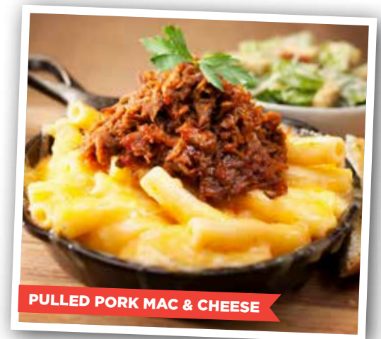
PULLED PORK MAC & CHEESE